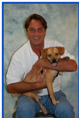
OZZIE & NEW DAD