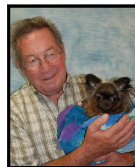
PRINCESS & NEW DAD