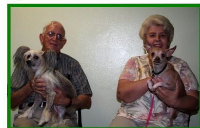
SOCKS & NEW FAMILY